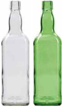
Standard clear or green