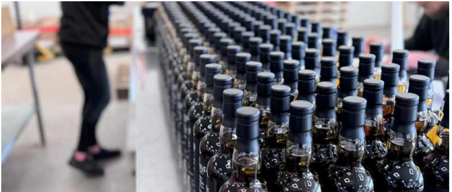
Staff labelling a customer's bottles seen here with black foil seal