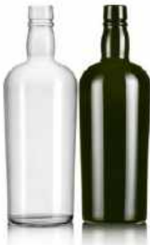
Douglas clear or green